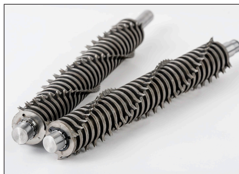
Aggressive cutting edges are fused to a steel shaft, creating an incredible bond and superior performance.