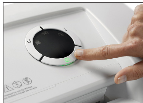
The easy-to-use command dial controls all shredder functions including power up, reverse, and continuous run.