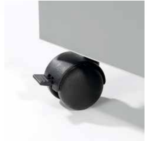
Practical swivel casters for flexible use