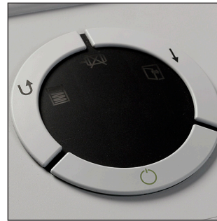
The easy-to-use command dial controls all of the shredder's functions such as power up, reverse, and continuous run.