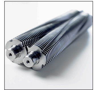
In order to provide slip free power to the cutting cylinders, a steel chain & gears connect the two for maximum capacity.