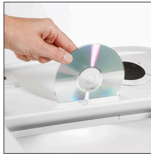
Dahle Professional shredder with built in user-friendly opening for CD/DVD destruction.